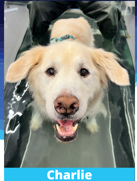
Rufus Kingsclere Vetinary Surgery